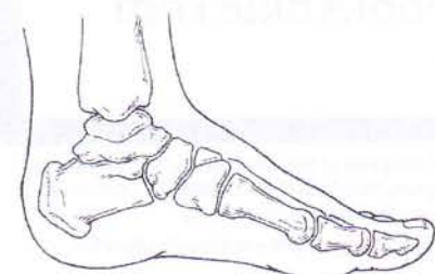
Normal pediatric foot